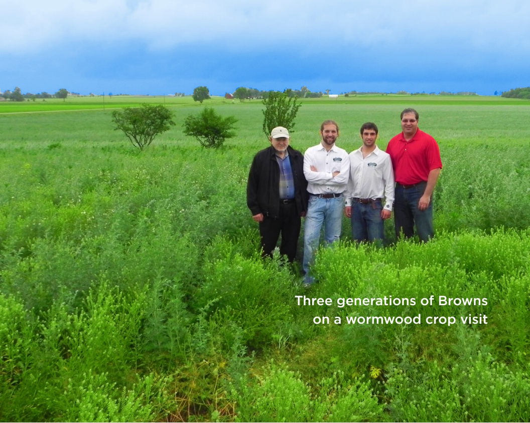
Three generations of Browns on a wormwood crop visit