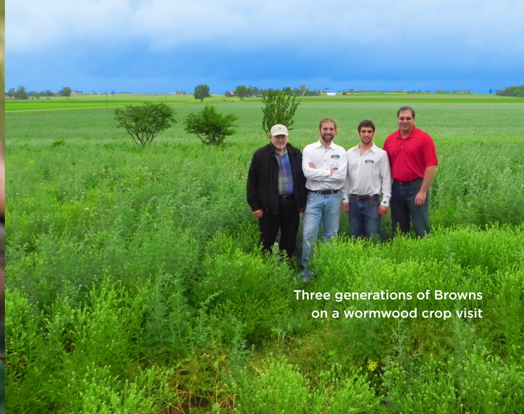
Three generations of Browns on a wormwood crop visit