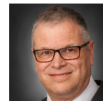
Original Fragrance by Jim Fuchs Senior Perfumer

Experience the natural beauty of the lush rainforest, tucked away far from city noise and daily life where you can breathe in the native locale and renew your connection to nature with the Mystic Isle trend. Layers of exotic fruits and indigenous flowers speak to the spiritual retreat of this trend.